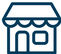
Small Business & Entrepreneurship