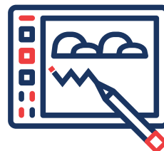
Graphic & Web Design