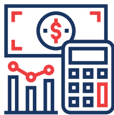
Finance & Accounting